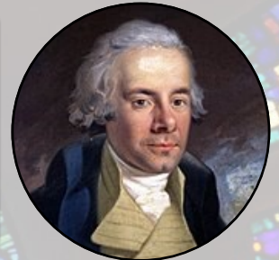
William Wilberforce 1759-1833

William Wilberforce was a British politician, philanthropist, and a leader of the movement to abolish the slave trade which led to the Slavery Abolition Act of 1833.