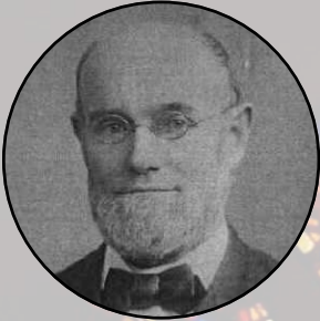
John Woolman 1720-1772

John Woolman was a North American merchant, tailor, journalist, and itinerant Quaker preacher, and an early abolitionist in the colonial era.