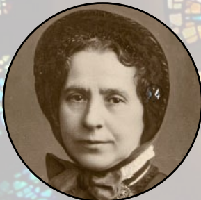
Catherine Booth 1820-1890

Sojourner Truth was an American abolitionist and women's rights activist. Truth was born into slavery in Swartekill, New York, but escaped with her infant daughter to freedom in 1826.