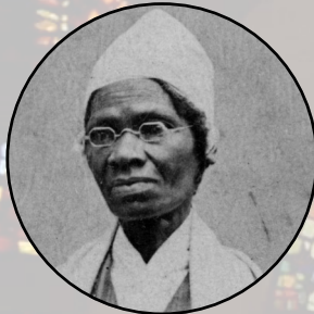
Sojourner Truth 1797-1883

John Woolman was a North American merchant, tailor, journalist, and itinerant Quaker preacher, and an early abolitionist in the colonial era.