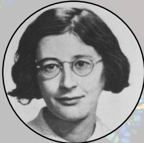
Simone Weil 1909-1943

Catherine Booth was a compelling preacher and co-founder of the Salvation Army. She is known as "The Mother of The Salvation Army."