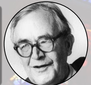
Karl Barth 1886-1968

Karl Barth was the most important Swiss theologian of the twentieth century. He is considered to be one of the greatest thinkers within the history of the Christian tradition.